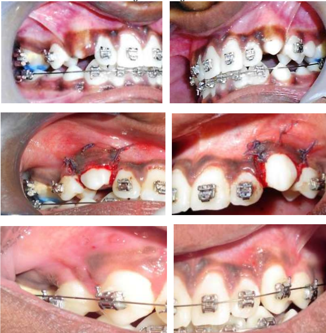
Figures 1a-f: Case 1: (a), (b) Pre-operative; (c), (d) Apically repositioned flap irt 13, 23; (e), (f) Post-operative: Canines aligned in the arch.